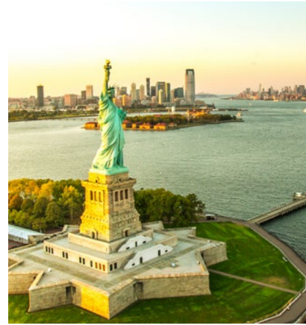
The Statue of Liberty