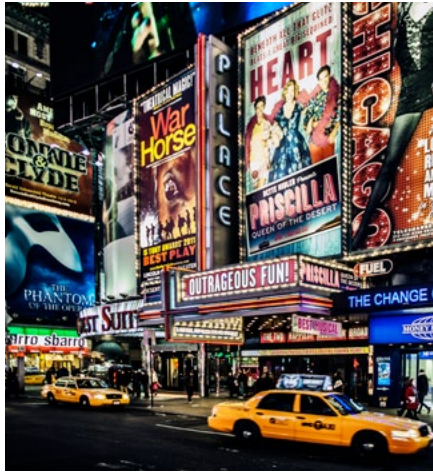
Broadway Theater District